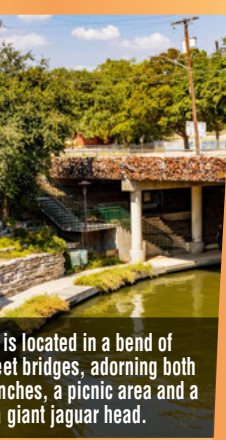
is located in a bend of et bridges, adorning both nches, a picnic area and a giant jaguar head.